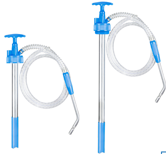
ATF HAND PUMP - 20L AHP20-01