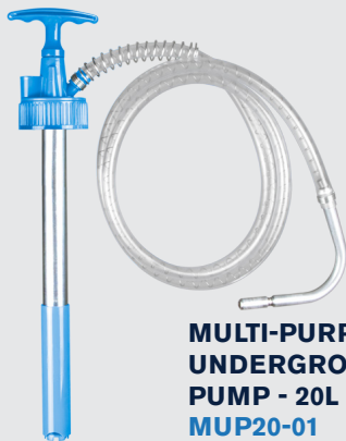
MULTI-PURPOSE UNDERGROUND PUMP - 20L MUP20-01